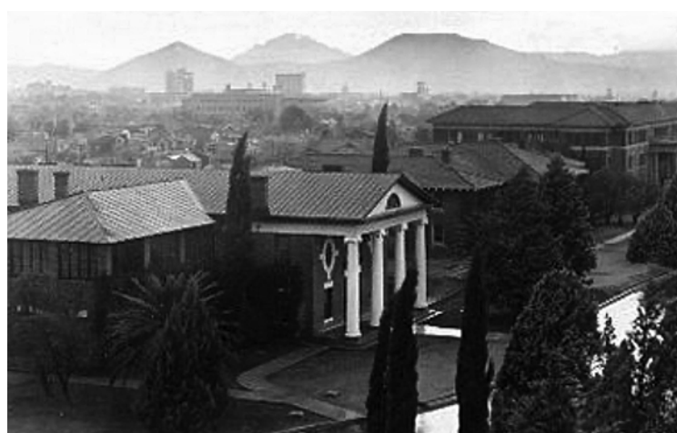
The University of Arizona Campus Arboretum

refreshments provided by our member volunteers and also, everyone can get a free plant offered to you by the TCSS.