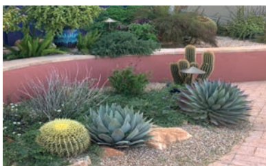
Partially handicap accessible

Soil and fertilizing...I augment the natural soil by adding potting soil and vermiculite or perlite for cactus plantings. Every six weeks or so, I alternate fertilizing with an all-purpose plant food and then an Epson salt mixture. I am always reminded that plants have a life span. I had a beautiful knife acacia tree that lasted about 15 years, its normal life-span. Just part of nature.