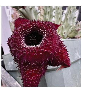
Huernia 'Spiny Norman'